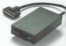
External diskette drive