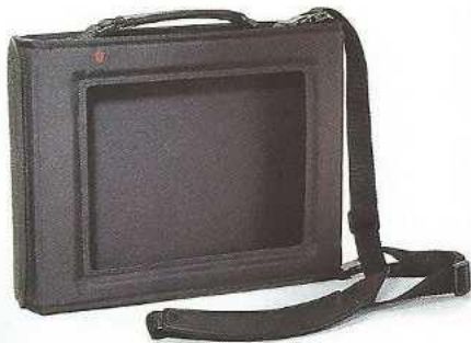
Standard carrying case (included with 700T)