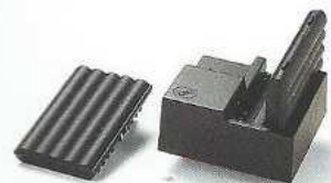
Two-slot battery charger