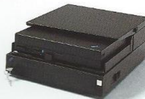
3550 Expansion Unit